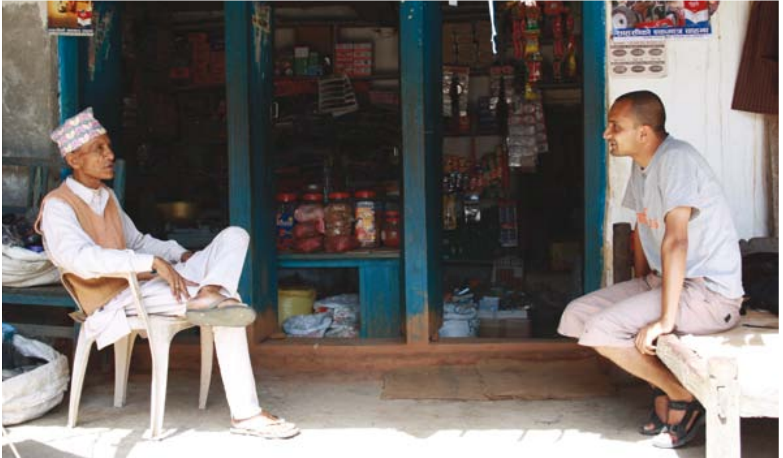
Fieldwork interview in Nepal.