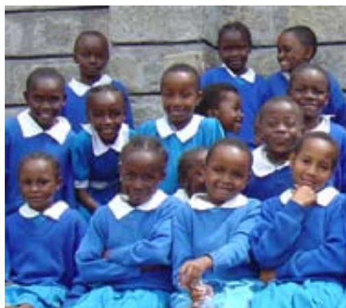
School children in Kenya