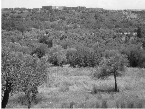
Figure 2. Dematona olive grove

militarized: it is now called Kalkanli, meaning ‘shielded’, though official toponyms from the land registry have been retained. The olive grove was designated as national heritage of ‘our country’, referring to the TRNC, which formally excludes Greek Cypriots and defines them as aliens. No mention of the people living in the heritage site thirty-five years ago was made.