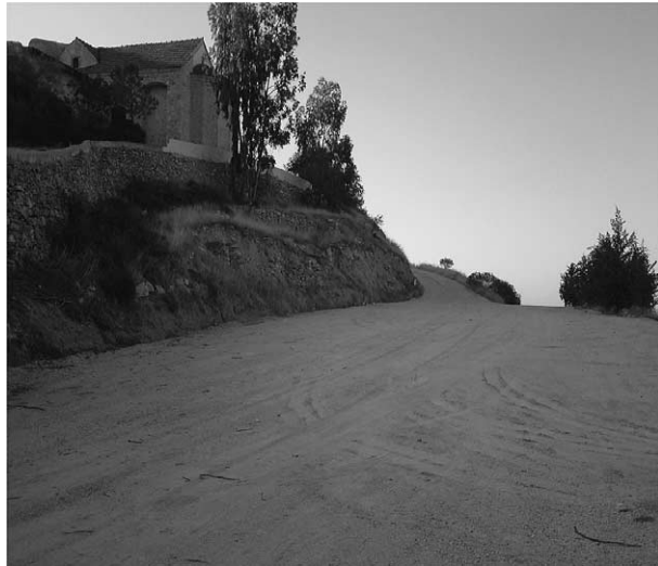
Figure 4. Ayioi Iliofotoi church and cleansed spaces

Today, the Ayioi Iliofotoi church itself is part of the Greek-Orthodox heritage of Cyprus and often listed in some web sites and cultural magazines. 3 At the same time, there is hardly a mention of the