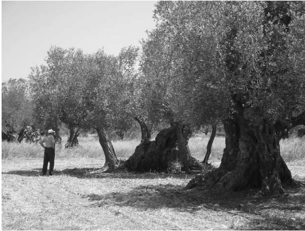
Figure 1. Ancient olive trees in Dematona

that I own –the purchase of which he originally viewed with great distaste! From this perspective, Dematona has been a heritage of ambivalent value for him; not much concerned with its status or eager to visit it, but once there completely overwhelmed with emotions and recollections of village customs, traditions and ways of living prevalent in his early life and now only symbolically experienced. This was a heritage that my father disowned; the olive trees as separated from land had no real economic value in an era of mass, mechanized agriculture and the heritage value of these ancient trees did not occur to him until he visited the place. This is in line with the otherwise rich official website of the village run by the Greek-Cypriot refugees, 2 which shows panoramic pictures of Dematona but does not identify the ancient olive grove as a heritage or important site. Though there is no doubt that it still has a place in people's hearts and imagination as the anonymous poem 'Desire' posted on the website indicates: 'the desire to be embraced by the village, to dance in Dematona and celebrate in the olive grove'.